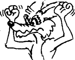
CHARITY AT HOME

6. Some years the tithe was not to be given to the church at all. Rather it was to be used for acts of charity in the giver's home city. Deut. 14:28 says, "At the end of three years thou shalt bring forth all the tithe of thine increase the same year, and shall lay it up within thy gates: And the Levite, and the stranger, the fatherless, the widow which are within thy gate, shall come, and shall eat and be satisfied."