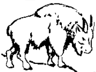
ALEXANDER, THE GOAT, WAS AN ANTI-CHRIST. HE WAS A DESTROYER.

JESUS, THE LAMB, IS A BUILDER. BOTH MEN LIVED 33 1/2 YEARS BOTH WERE WORLD CONQUERERS.