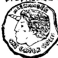
ALEXANDER WAS SPOKEN OF SYMBOLICALLY IN DANIEL 8 AS A ONE HORNED GOAT. COINS OF HIS TIME PICTURED HIM WITH ONE HORN PROTRUDING FROM HIS FOREHEAD.

Thus the prophecy says that in 1967 the sanctuary will be cleansed. And we know that on June 7, 1967 the holy places in Jerusalem were taken from the Moslems and returned to the Jews just as prophesied 2300 years before.